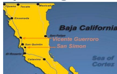
Mission Project to Baja