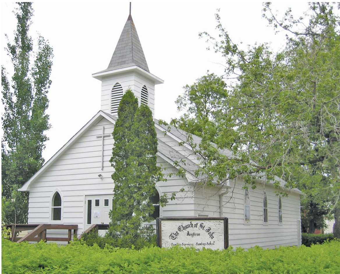
St. John's Anglican Church, Borden, Sask. St. John's is one of the parishes of the River Valley Parish.