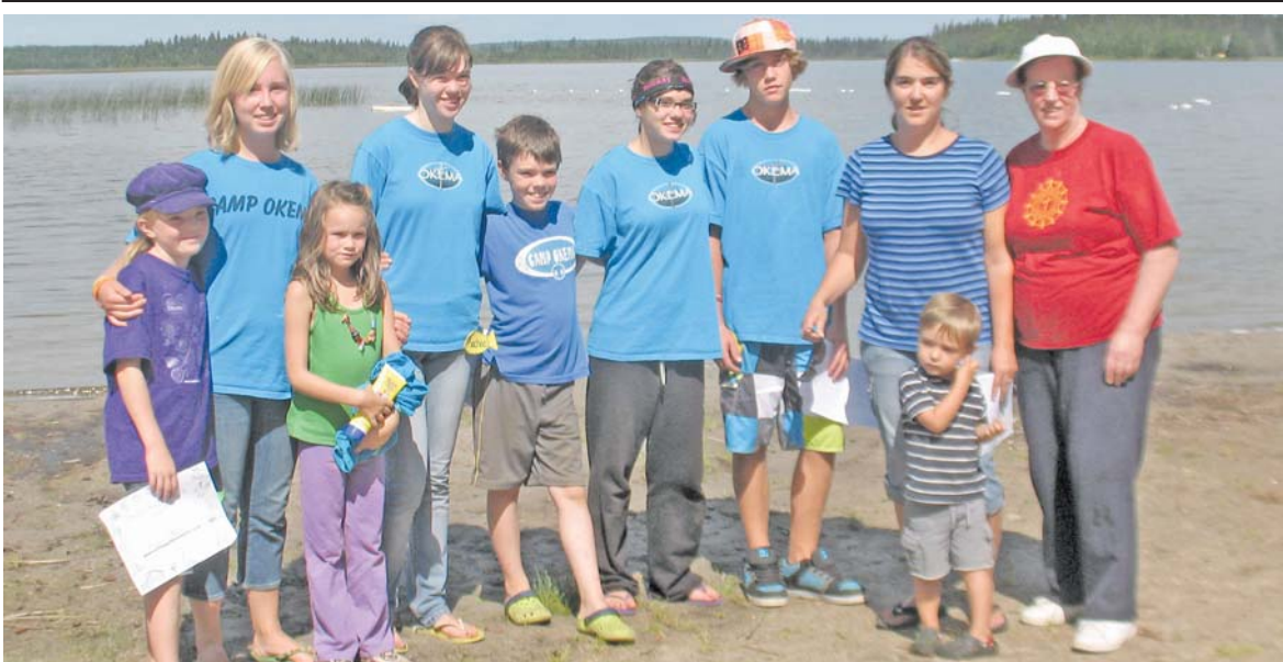
Youth and their councillors from Camp Okema in northern Saskatchewan gather for a group picture near the end of their summer camp in August. For the story about Camp Okema, see page 6.

However, with William James in his "Will to Believe", I hold that faith to believe or disbelieve in God extends beyond the confines (Continued on page 5)