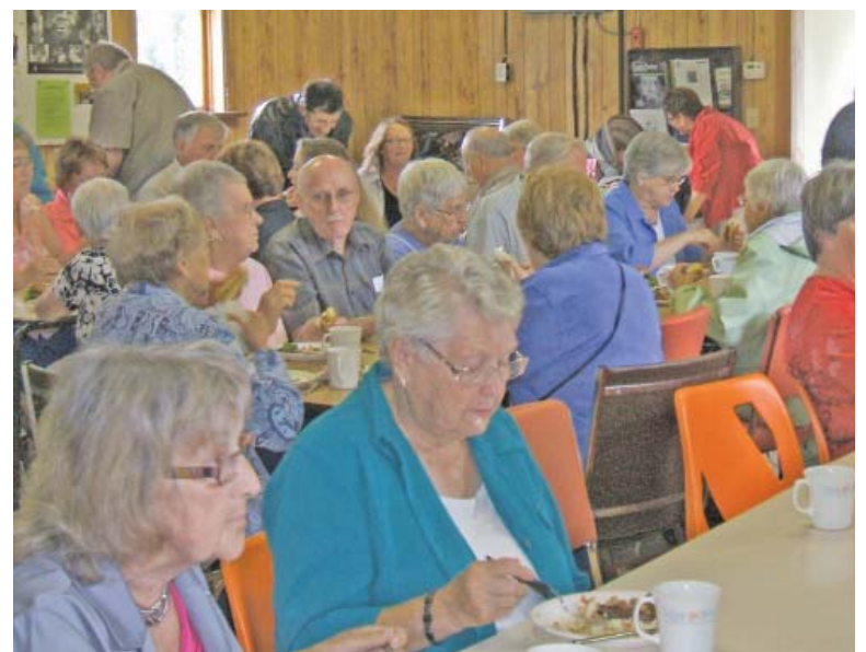
The Church Hall was packed for the lunch after the annual Parish Sunday communion service. The three parishes included Arborfield, Hudson Bay and Nipawin.

The close quarters meant more chances to meet our Anglican brothers and sisters in Christ.